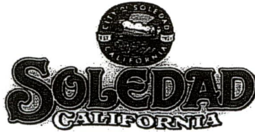
EXHIBIT - A